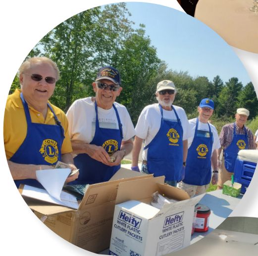
Charlevoix Lions Club hosted a BBQ at the pool to celebrate the pool's 25th Anniversary.