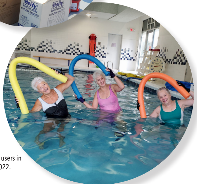
Aqua Ex classes saw 23% more users in 2023 than in 2022. (year to date)