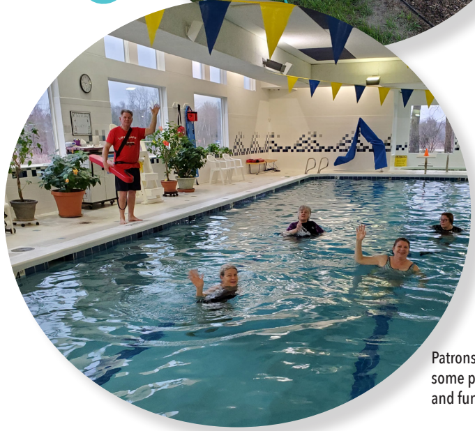
Patrons enjoying some pool fitness and fun.