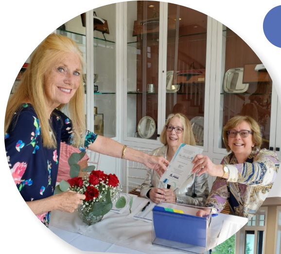
The Aqua Silver Gala celebrated the 25th Anniversary of the CACP.

Lifeguard classes are also offered regularly to help fill our constant need for lifeguards. To date, we have had 48 people take lifeguard classes; some were for recertification. Like other businesses in our area, we struggle with staffing issues to keep a full weekly schedule.