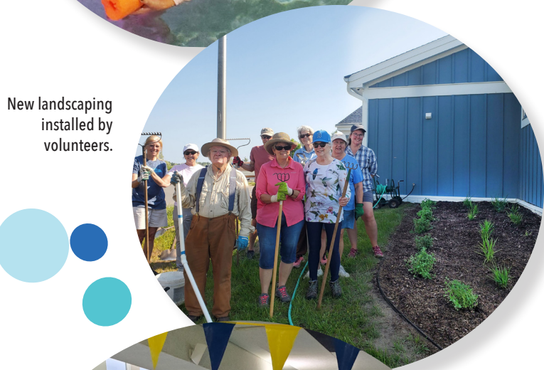
New landscaping installed by volunteers.