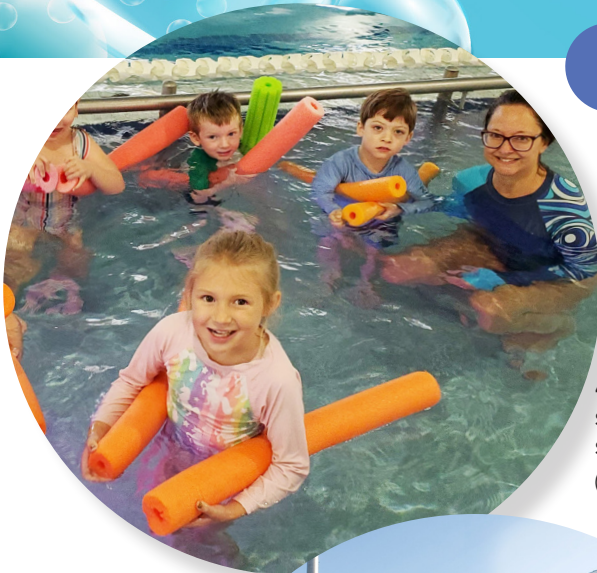
423 children took swim lessons or water safety classes. (1/1/23 to 10/1/23)

We also want to thank these businesses for their year-long pool sponsorships: Harris Law PC, Bergmann Marine, Fernelius Auto Group, Bayshore Animal Hospital, Bayshore Steel Works LLC, Irish Boat Shop, Berkshire Hathaway Home Services and Real Estate, St. Marys Cement, The Manthei Group, Princeton Management/Lake Michigan Heights, Fletch's GMC/Buick/Audi, and Bingham Insurance Services.